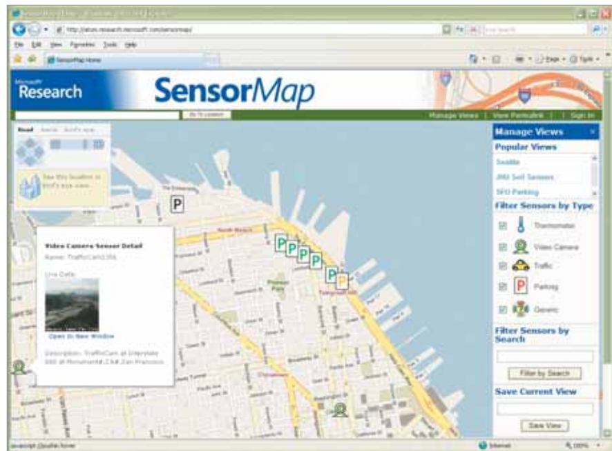
Figure 2. SensorMap GUI. Based on Windows Live Local, the GUI provides zooming, panning, street maps, satellite images, and 3D views.

client machine as cookies for quick retrieval. Figure 2 depicts an interface showing street-parking data that StreetlineNetworks published for a section of San Francisco.